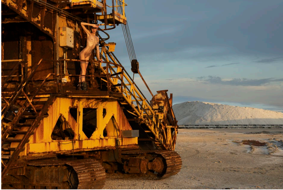
"Finding Gold" 2020 © French Cowboy aka Mia Macfarlane & Julien Crouigneau