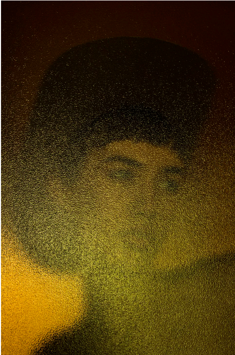
"Cowgirl in the Blur" 2020 © French Cowboy aka Mia Macfarlane & Julien Crouigneau