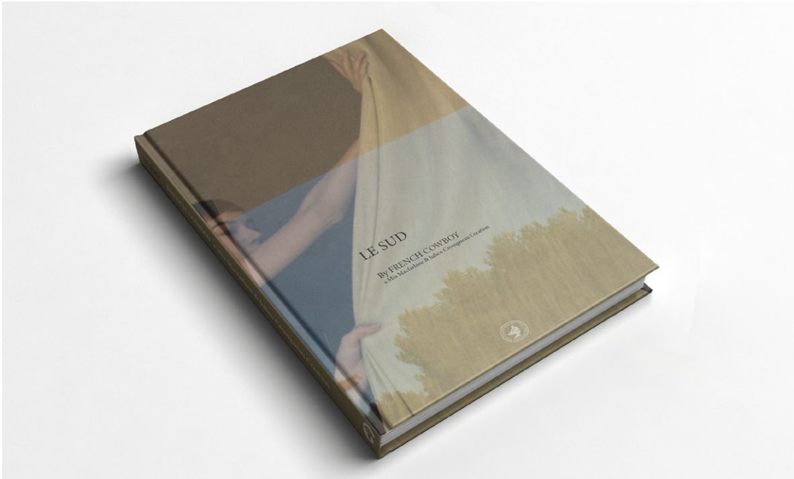
"Le Sud" 2021 © French Cowboy aka Mia Macfarlane & Julien Crouigneau. Published by Les Editions des Loups de Steppes.