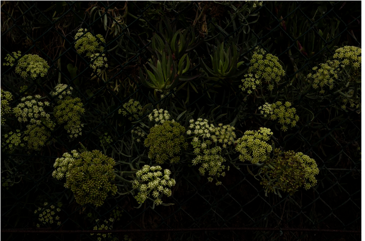
"Fenced In" 2020 © French Cowboy aka Mia Macfarlane & Julien Crouigneau