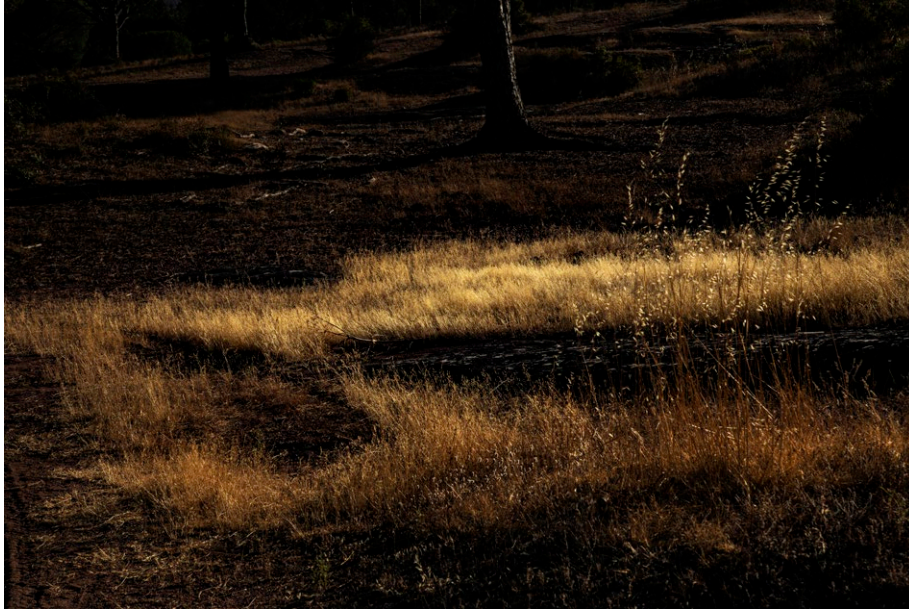
"Finding Gold" 2020 © French Cowboy (Mia Macfarlane & Julien Crouïgneau)

FRENCH COWBOY "LE SUD" , IRK GALERIE, ARLES – Entering Le Sud is like walking down a fresh path, your body alive with a sense of the world around you. Feeling the weight of the summer heat, the cooling breeze against your skin, hearing the brief rustle of grass mixed with the sound of cicadas. Or catching a glimpse of an unknown face in a passing doorway, or perhaps a better description is that of a hand against your face, the sight of a lover walking through the room their body glistening in the morning light as it moves past a window framing the countryside, your body seeped in the relaxation of a vacation well earned, every sense aware after an intimate morning. And then there is the light, it is always the light, illuminating each subject with energy and emotion, sometimes so close that you can almost touch it, other times farther away, yet always beyond your reach. In their book, Le Sud , Paris based collaborative French Cowboy bring us into this land, one where David Lynch might play, filled with questions not all answered which is one of the book's great delights.