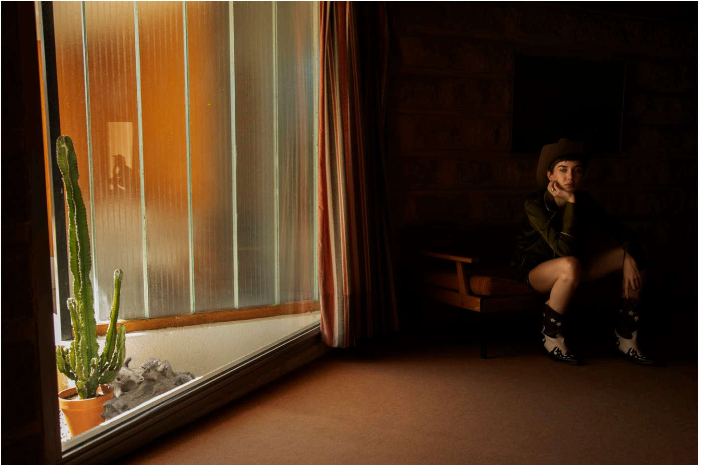
"Two Cowgirls in a Waiting Room" 2020 © French Cowboy aka Mia Macfarlane & Julien Crouigneau